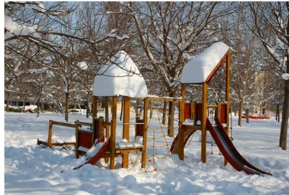
Snow in Parco del Gazebo, Bologna, Italy - S. Deepak, 2012