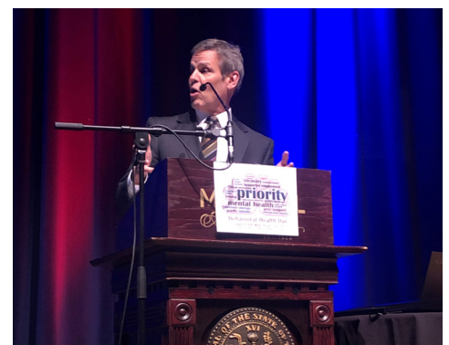
Governor Bill Lee